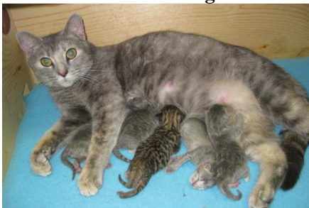
Orchid, our dilute Torti gave birth to 5 kittens on 3/19/11.