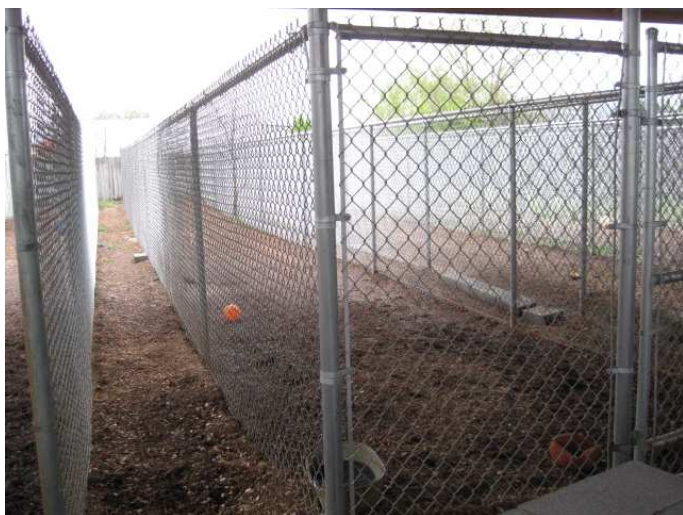
Our 4 new exercise dog run measure 8' x 70'. Large dogs need this room to run and play. 1/3 of the front portion of these runs are under the roof of our “pole barn” providing shelter when it rains.