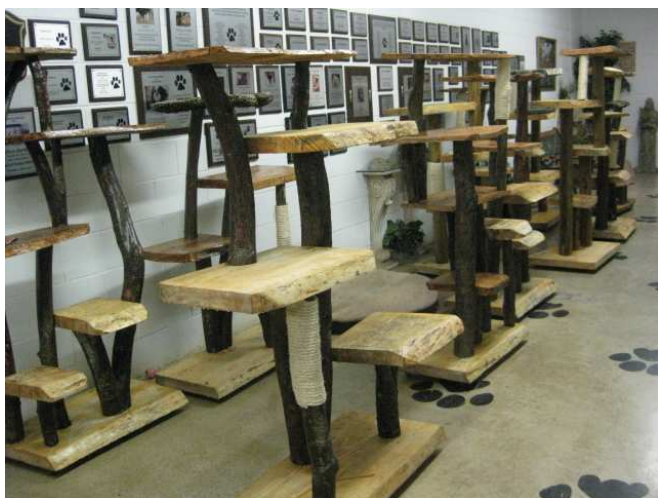
Our new cat trees after delivery. We added the sisal rope before placing the trees in our free roaming cat rooms.