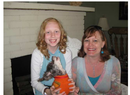
“Charity” singing her song!