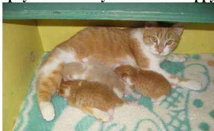
Twinkie, our Manx mommy gave birth to 3 kittens 3/9/11. One has a bob tail, one a Manx, and one long tail.

Spring is a beautiful season. We see the beginning of new life in the budding of trees, grass turning green, early blossoms, warmer with more sunshine, and robins in our yards. Sadly, most animal shelters dread spring because with it comes other forms of new life: nursing mommy cats, expectant mommy cats, and cats giving birth at the Ark. Each time an expectant cat or a nursing cat comes aboard the Ark, a private room must be available for each mother. This limits our intake of other cats because of space. We provide a birthing bed that was constructed by volunteers. This prevents the kittens from wandering away from mama. Each bed has a heated kennel pad. The temperature remains at a preset factory degree that will keep the pad at the same degree at all times. The bed is removed when the kittens start to climb over its walls. This allows them the freedom of the room. During April and May of 2010 we had 56 kittens and 4 nursing mothers in our shelter. We are already receiving those dreaded phone calls. "My cat had kittens can you take them?" "This stray came to our house and had kittens." "I found kittens under my shed." No shelter can take all the ones that need shelter. Please spay and neuter your cats. A happy cat is a cat that does not go outdoors.