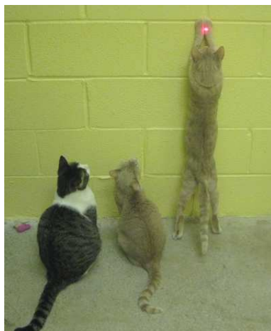
“Cats and Laser Beam”