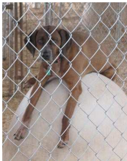
“Oliver” Visit and hang out with me.