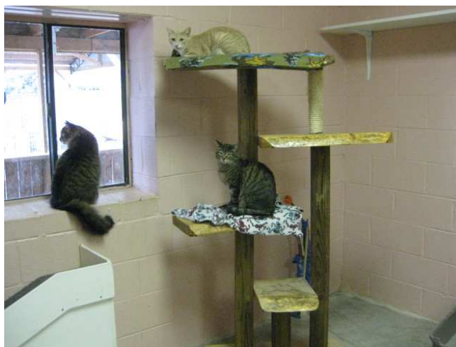
Pooh Bear, Archie, and Bonnie on their new cat tree waiting for warmer weather. They love to go out on their “catio.”