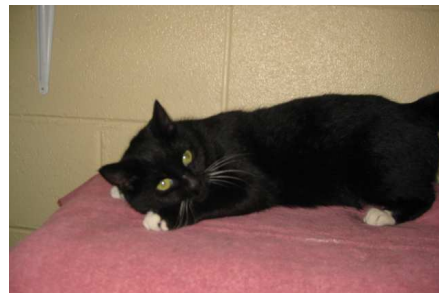
Beauty, our tuxedo is a baby expecting babies! She is only 7 months old.