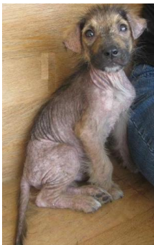
BREWSKY - BEFORE SEVERE MANGE