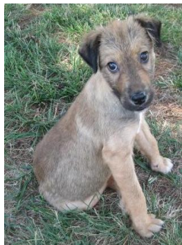
BREWSKY AFTER NEW HAIR & HAPPY