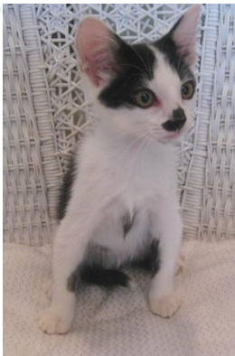
Mickey/Jester After vet care